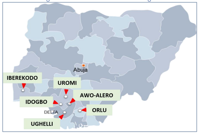
Figure 1: Communities assessed in Nigeria

The field research in Nigeria was carried out in February 2018. The tools used in the study included: 532 quantitative surveys with young people aged 15 to 34, 12 focus groups (2 per community), 6 community