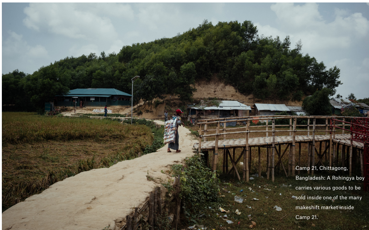
Camp 21, Chittagong, Bangladesh: A Rohingya boy carries various goods to be sold inside one of the many makeshift market inside Camp 21.

Overall, programming that supplements economic strategies with other elements, and which aligns economic strategies with needs and drivers specific to the forms of GBV they seek to address, are likely to be the most successful in creating sustainable impact.