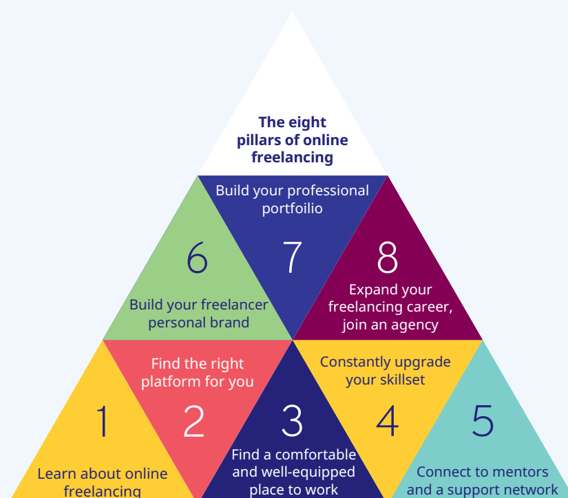
► Figure 1. RESI Dadaab: The eight pillars of online freelancing

As well as having access to training programmes, mentoring and coworking spaces, RESI programme beneficiaries can apply to the Dadaab Collective Freelancing Agency – a collective of refugee workers acting as self-employed freelancers through Upwork and other platforms. Such an agency provides a space for mutual support and allows the bidding for larger projects that can contract a collective of freelancers. Workers pay 10 per cent of earnings to the agency, which is fully self-reliant and not dependent on funding. RESI also provided new entrants with a start-up kit that includes a laptop and other equipment, although this equipment support was discontinued for various reasons. Besides the dedicated online freelancing training, other courses also include basic and advanced computer applications (Computer Secretariat) as well as graphic and web design.