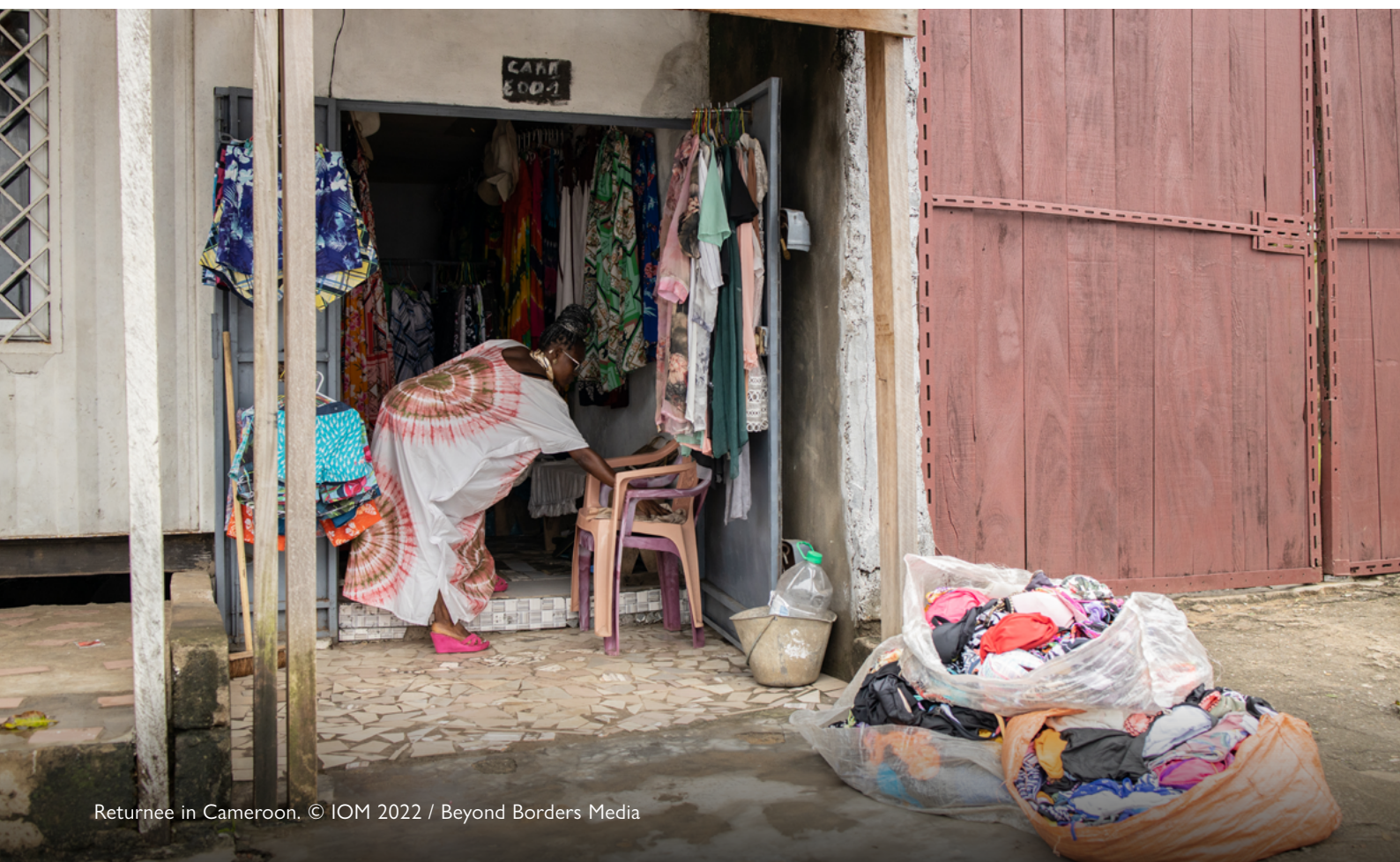
Returnee in Cameroon.