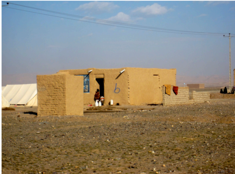
Exterior of IOM shelters in Taqi Naqi, Herat Province

IOM provided shelter assistance to beneficiaries in Nangarhar in 2008 and Herat and Nimroz in 2010, through a self-help programme where beneficiaries were given the materials and instructions necessary to construct their own homes. Shelter assistance is addressing a proven need of populations on the move and represents a first step in the reintegration process.