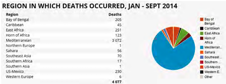
Figure 3.1: Number of deaths between January to September 2014

The human cost of migrant smuggling is reflected by the migrant deaths reported and the protection risks they face along the smuggling route. There has been an increase in migrant deaths along migration routes revealing protection risks of migrants crossing the Mediterranean and deserts (IOM, 2014). Interventions by European countries receiving migrants such as naval blockages and a surveillance system have not curbed the number of migrants heading to Europe. Eritreans and Somalis remain the largest populations from Eastern Africa bound for Europe. Currently, there are limited official statistics on the number of migrant deaths along the migration routes as some a small number of migrants die along the way in the desert and in the sea that are unaccounted for. Figure 3.1 shows the number of deaths that occurred between January and September 2014 across the globe, and it is noticeable that the Mediterranean leads the list.