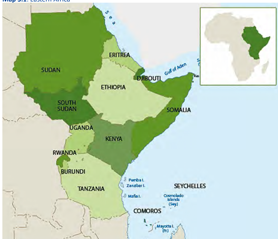
Map 3.1: Eastern Africa