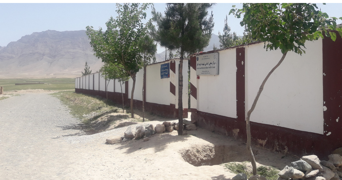
Health clinic in Barikab township, Afghanistan.

Despite these circumstances, there were a small number of cases where material assistance was provided, and in turn recipients experienced a significant, albeit short-term, psychological relief. For example, a Pashae IDP in Nangarhar described how her family’s landlord, upon realising their dire financial situation, halved their rent, before reducing it by a further 500 AFN ($5.60). 76 Additionally, a Jogi IDP described how a former employer, upon seeing the poor conditions in which her family lived, now assists her family financially whenever they can. 77 Such examples were rare, representing instances of host community members assisting IDPs. For IDPs, they uniformly stated that they absolutely did not have the resources to assist other IDPs materially, no matter how much they wished they could.