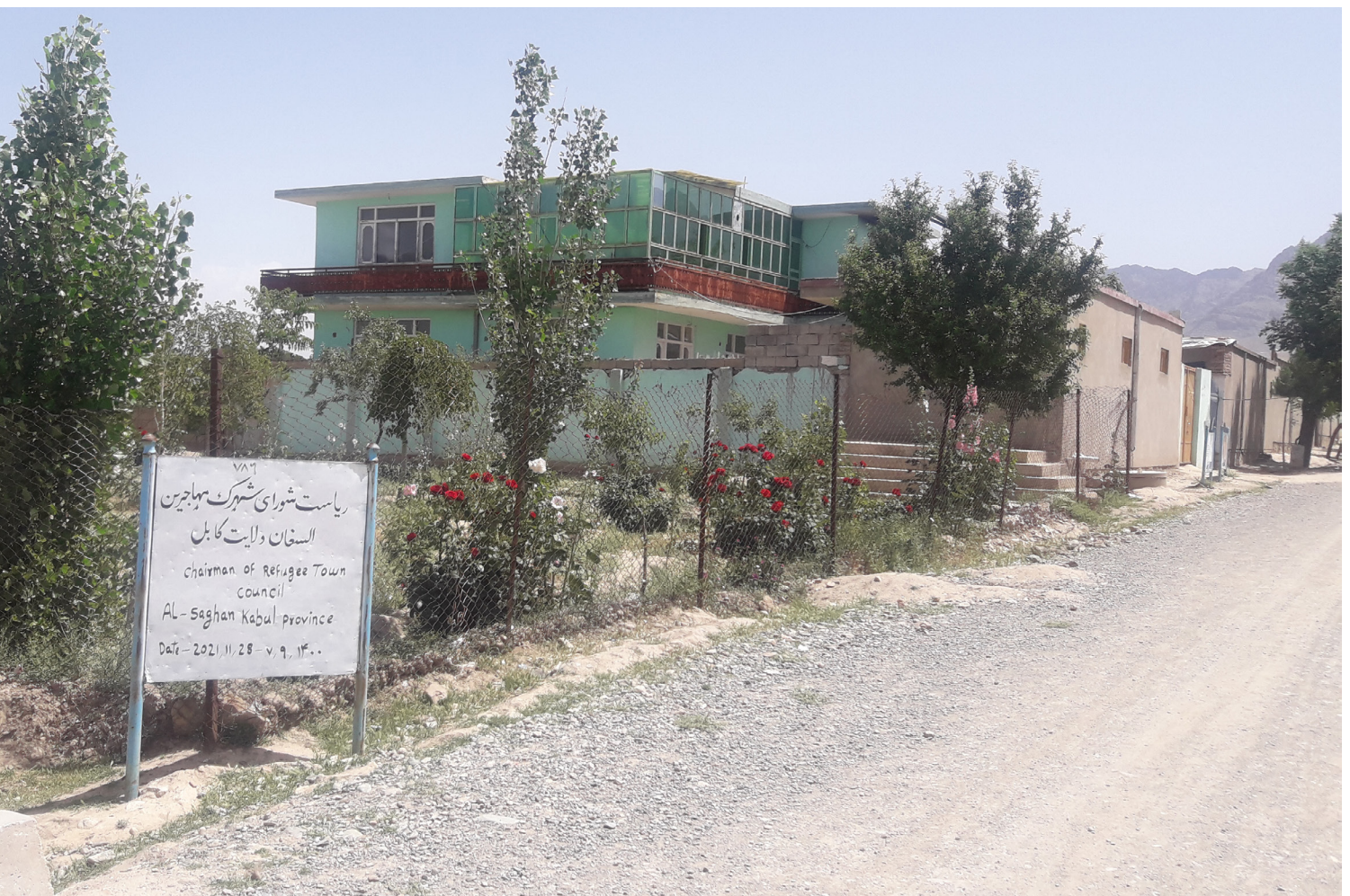
Barikab, Alasghan township, Afghanistan

Though not decisive, this research also points to a potential shift in trends associated with suicide. Around 3,000 Afghans commit suicide every year in Afghanistan, with the vast majority of these being women. 20 More than half of these cases typically take place in Herat province. 21 Media reports commonly cite domestic violence, absence of sufficient support for abused women, and poverty, as the primary causes of suicide and suicidal ideation in Afghanistan. 22 Narratives from female respondents in Herat frequently mentioned suicide for various reasons or in varying circumstances, but in a departure from the norm, suicide among men was also regularly cited in Herat. While further exploration of this matter was outside of the realm of this research, it represents a key factor to bear in mind when formulating MHPSS programming in Herat province, as well as an opportunity for insightful future research.