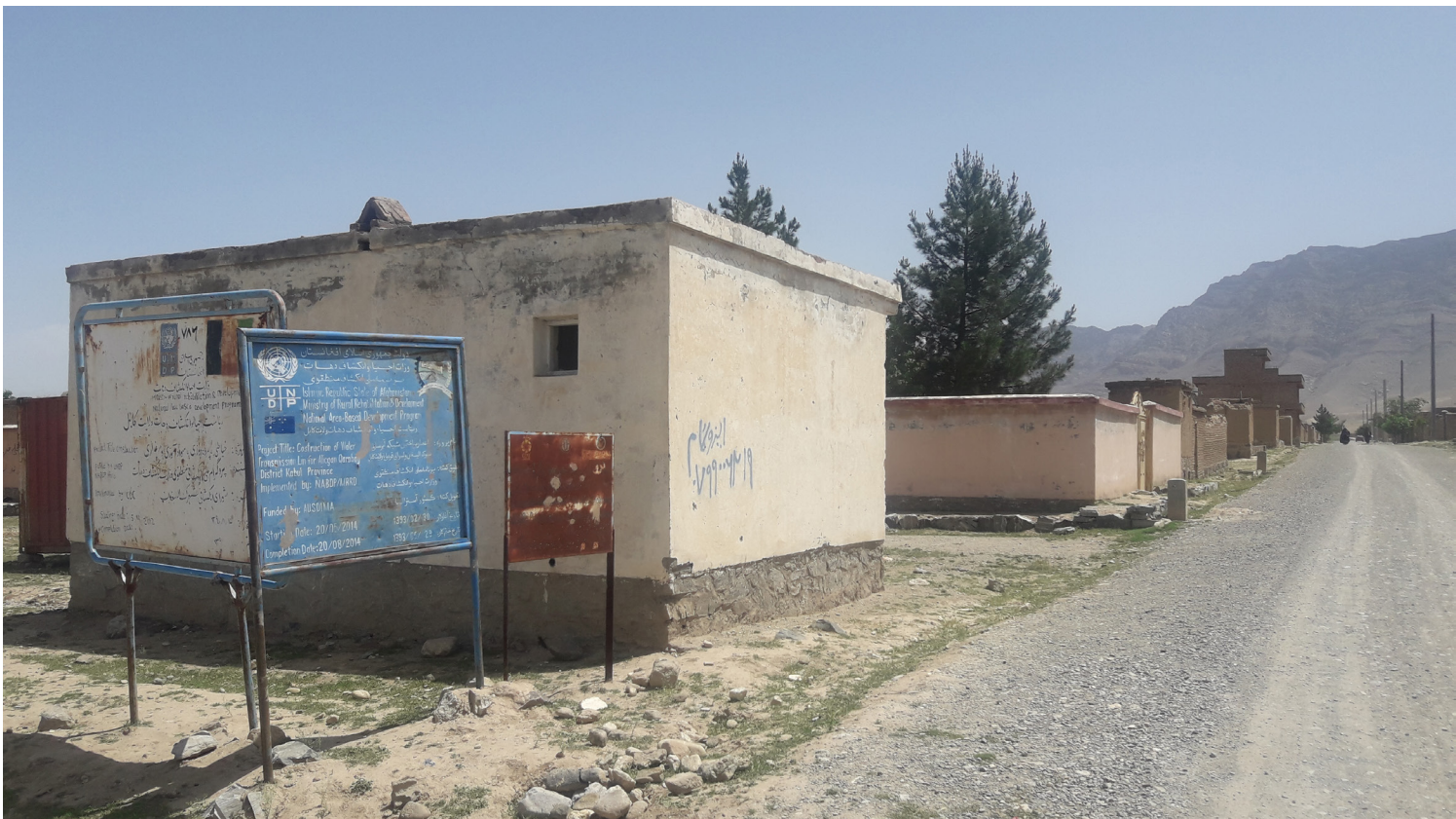
Barikab township, Afghanistan