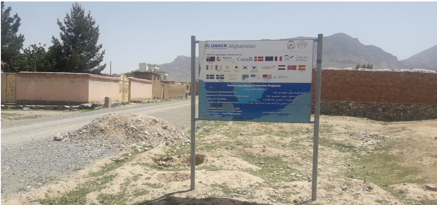
Barikab township, Afghanistan

Beyond the physical trauma, the mental health impacts of being contained within the borders of Afghanistan, with no legal recourse for migration, can have an enduring impact on mental health, notably among those experiencing rounds of rejection and forced returns, and among women left behind. After the fall of Kabul in August 2021, the irregular passage of Afghans to Iran dramatically increased: records show that 63% of exits in 2021 towards Iran took place after August 2021. However, these passages imply elevated risk and traumatic events, as reported by Amnesty International – including Afghans unlawfully returned after coming under fire at borders. 66